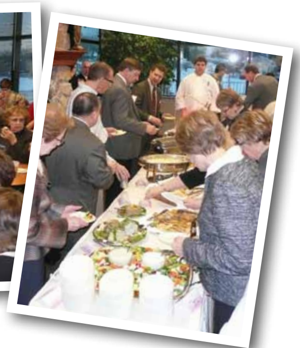
The Chamber of Commerce Legislative Mixer is attended by many business people and lawmakers. BND hosts the biennial Legislative Mixer which took place earlier this year.